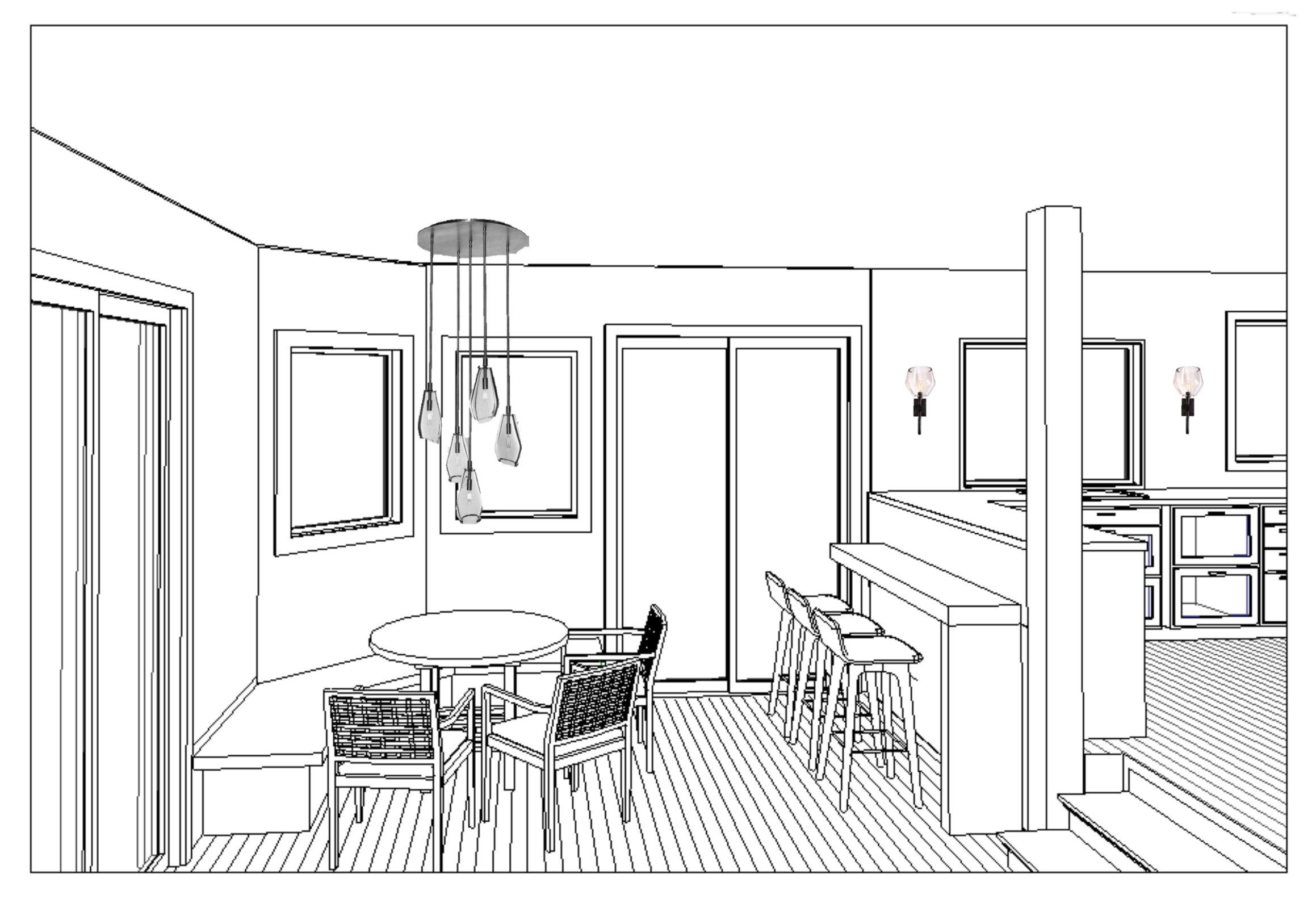
KITCHEN TABLE AND LARGER BIFOLD SINK WINDOW

SANTA CRUZ S t u d i o D I V O INTERIOR RENDERINGS F R A N C E · C A L I F O R N I A