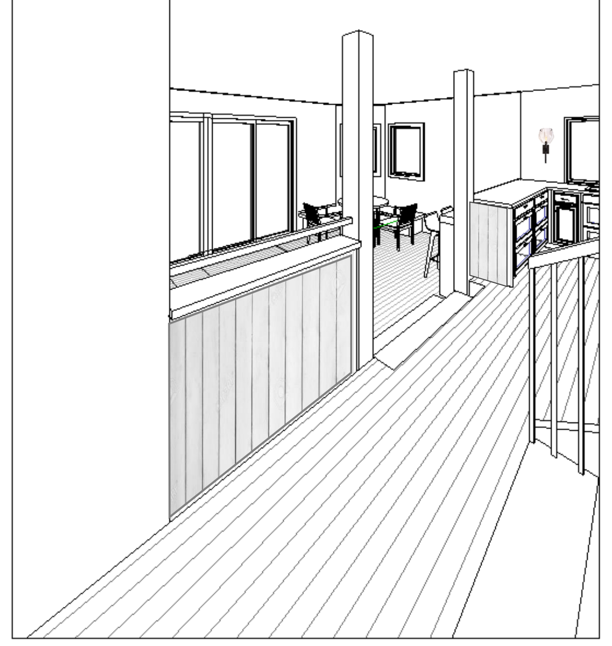
VIEWS SHOWING LOW WALL: AS VIEWED FROM BANQUETTE AND FROM CORRIDOR SAME PLANK AT BAR AREA; KITCHEN; AND LOWER WALL