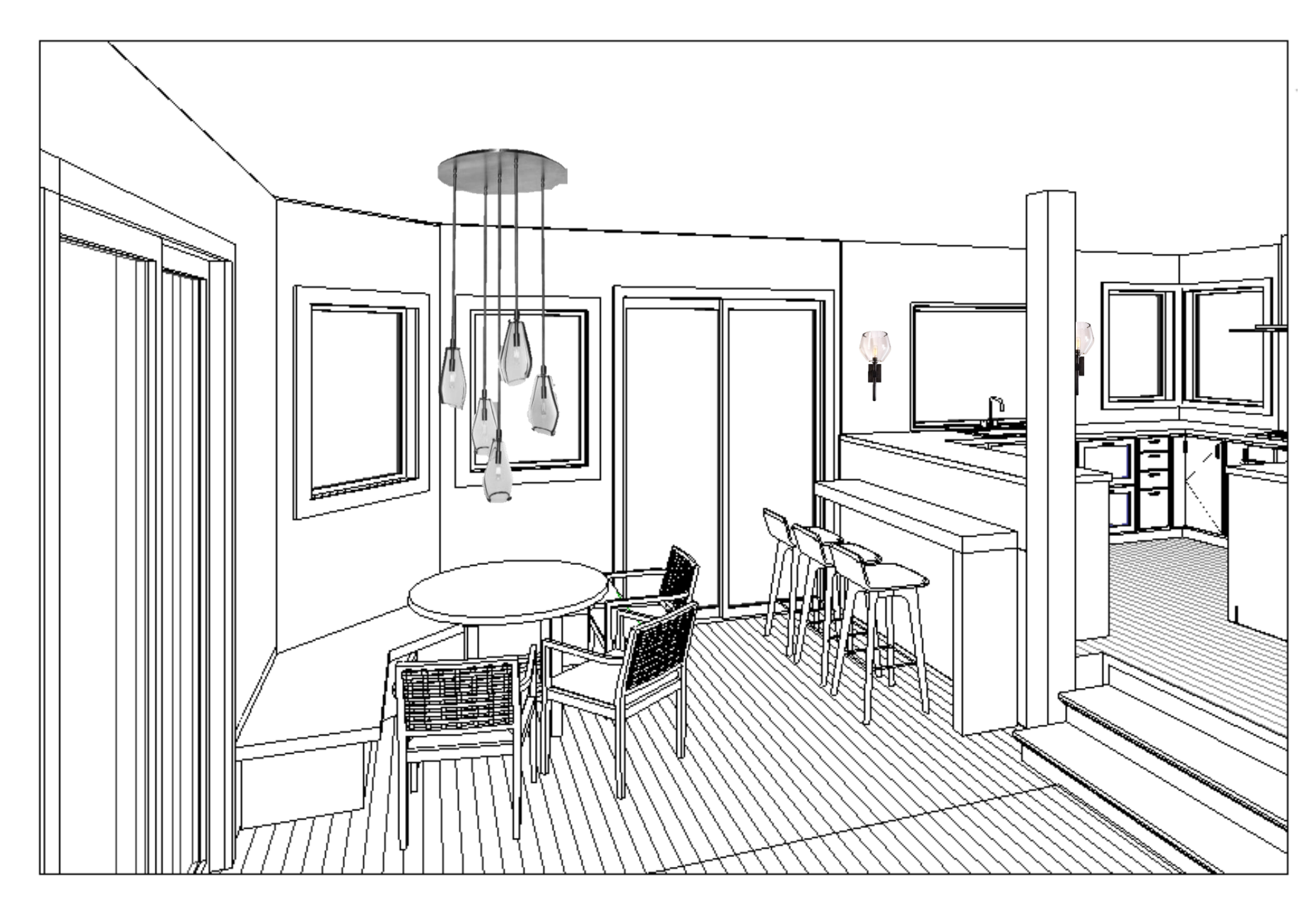
VIEWS SHOWING LIGHT FIXTURES COMBINED FOR REFERENCE PENDANT AT TABLE AND 3 SCONCES AT KITCHEN AREA